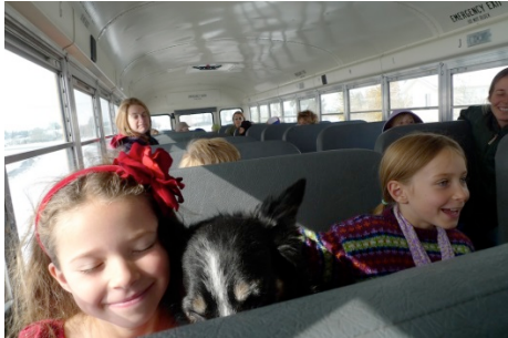
Our daughter with Doc (2013). Best bus ride ever.

"We rented a school bus for our daughter's 6th birthday, designed a route and picked up all her homeschool buddies who always complain that they miss out on riding the bus! Of course Doc went with!"